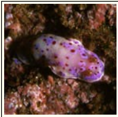
Fig. 3 ©Wayne Ellis