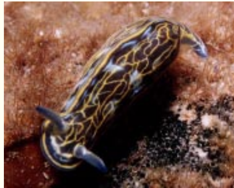
Fig.2 © 2000 Josep M a Dacosta