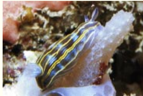
Fig. 1 © 2000 Miquel Pontes

This month Miquel Pontes was assisted by Josep M a Dacosta in preparing this article and supplying the images.