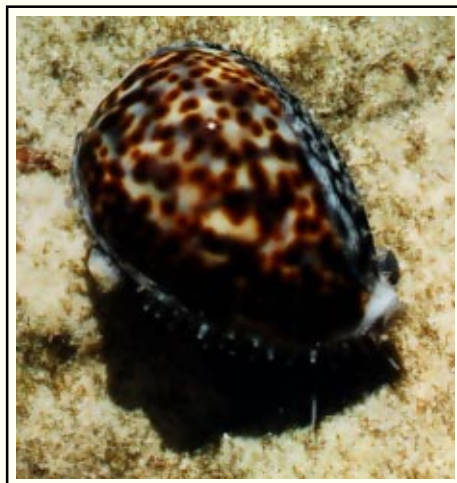
Fig.1 Cypraea tigris

International Commission on Zoological Nomenclature 1999. International Code of Zoological Nomenclature Fourth Edition . Published by the International Trust for Zoological Nomenclature, London, xxix + 306 pp.