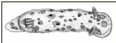
Fig. 4 After Rudman 1983