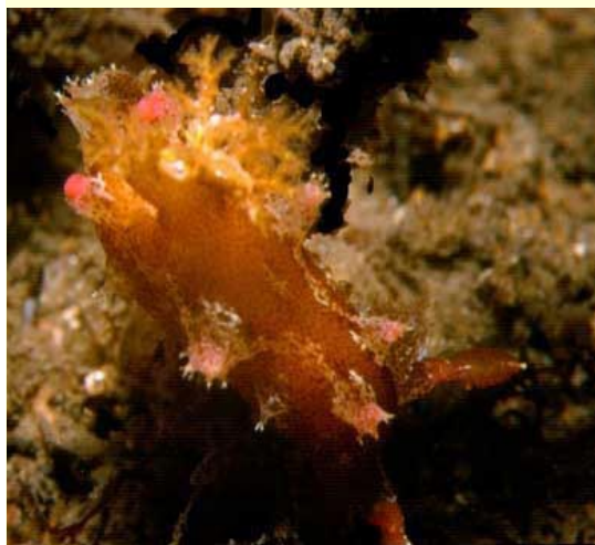
A Plocamopherus imperialis photographed at the Co-op, Port Stephens where it is common. Note the pink knobs.

From personal experience this species was a common sighting at Port Stephens (NSW Aust), especially at the Co-op.