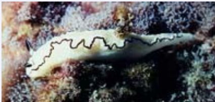
Fig. 3 Glossodoris atomarginata is similar in shape to Glossodoris vespa