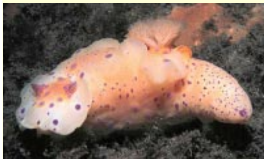
Ceratosoma brevicuadatum photographed at Fly Point, Port Stephens, NSW, Australia

http://www.austmus.gov.au/science/division/invert/mal/forum/cerabrev.htm