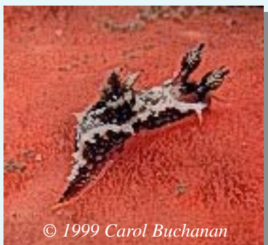
Polycera sp. (brown & biega)